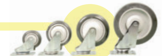
R&B Clean Wheel Caster