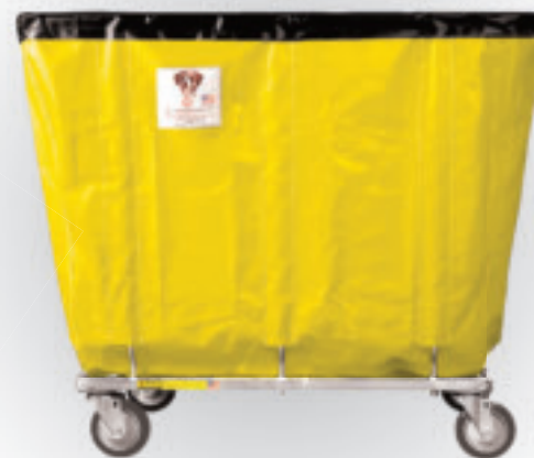
412KD After Assembly