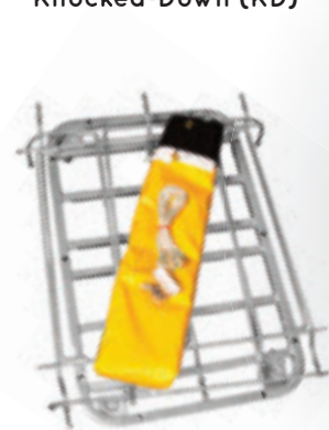
412KD Knocked-Down for Shipping